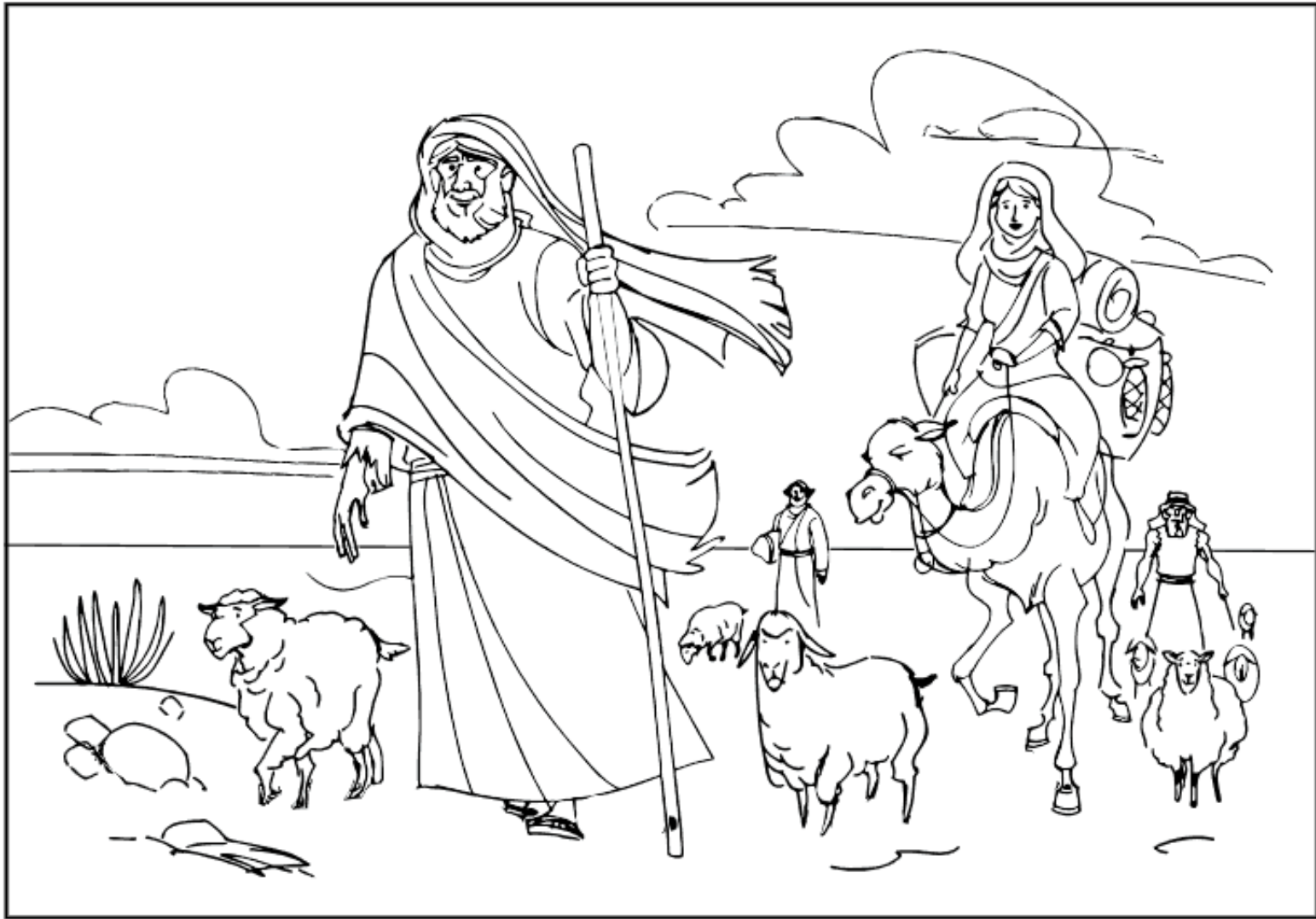
God guided Abraham.